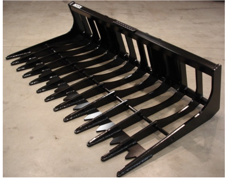
3/4" Tines with 6" spacing

Available Bucket Sizes 62", 68", 75", 82", 90", 96"