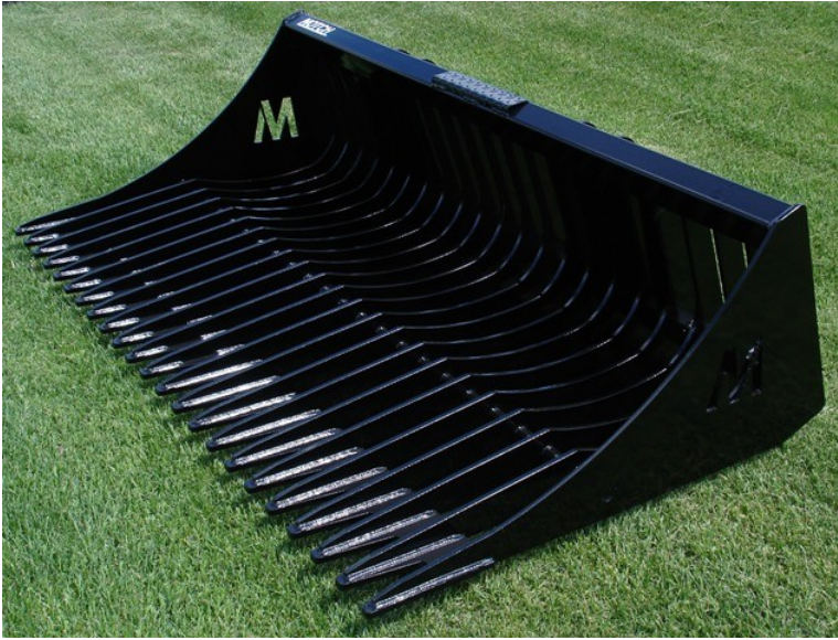
3/8" Tines with 3" spacing