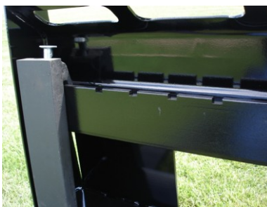
Domestic forged fork rail 1 1/4" x 4" Domestic Solid Fork Tines

Rolled top design, no sharp corners, for safe work environment