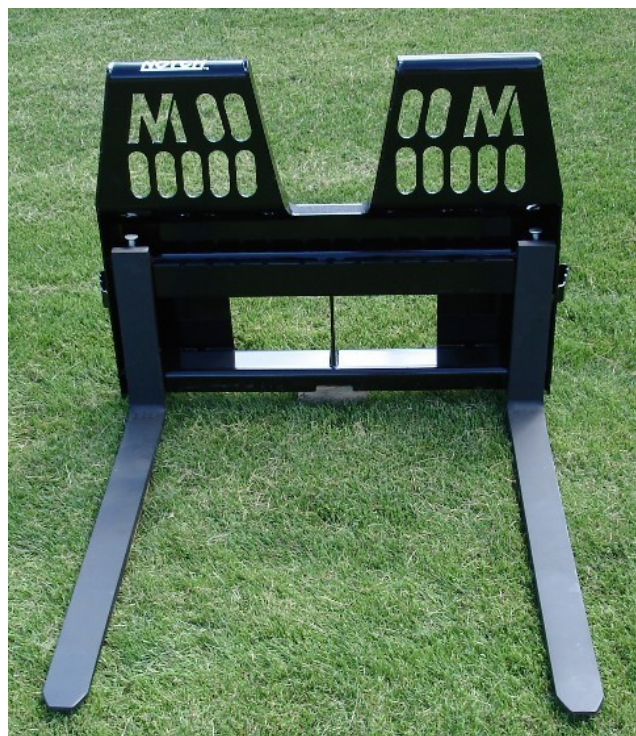
48" wide, walk through model

Side Steps Standard, High visibility back guard