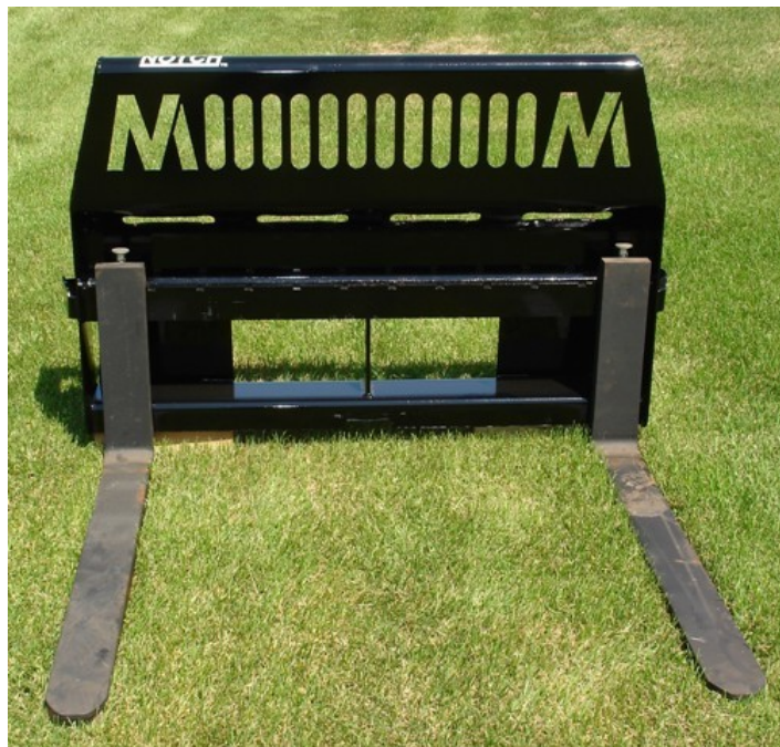
60" wide, solid back model