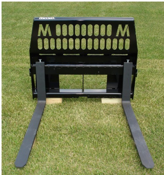
48" wide, solid back model

23664 State Hwy 4 Lake Henry, MN 56362 320-243-7248 • Fax: 320-243-7245 Website: notchmfginc.com